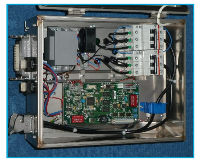
Inside the IRS cabinet