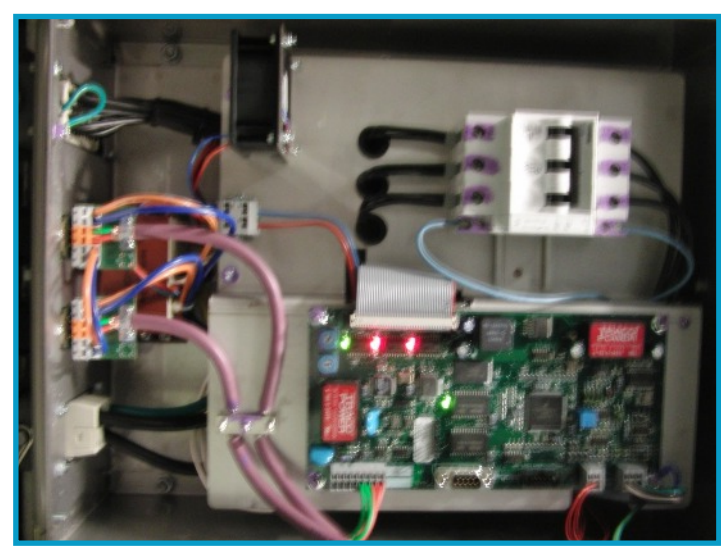
Inside the PWR-SDL cabinet